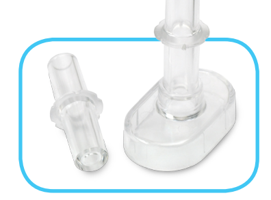
Breath samples can be taken with or without a replaceable, hygienic mouthpiece.