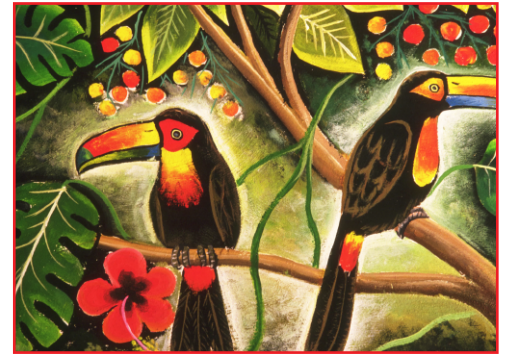
Animal spirits everywhere. Ravens. Jaguars. Captured in stone, in frescoes, in color .

You want to tell the story. You want to tell it in color. On your Apple Color StyleWriter 2400. Sharp resolution. Vibrant images. Crisp text. And so compact. You wonder how they manage to fit all those colors inside.