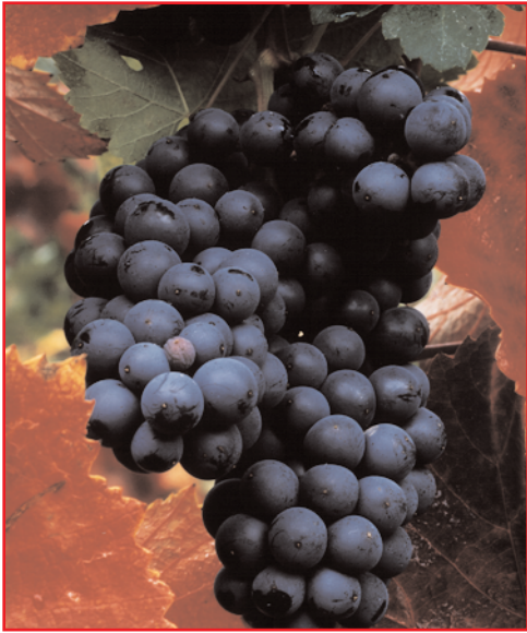
Color so fresh you can taste it!

You can't imagine life without color. Especially here. Teotihuacán. The birthplace of the gods. Site of a towering monument to everything that's light—the Pyramid of the Sun.